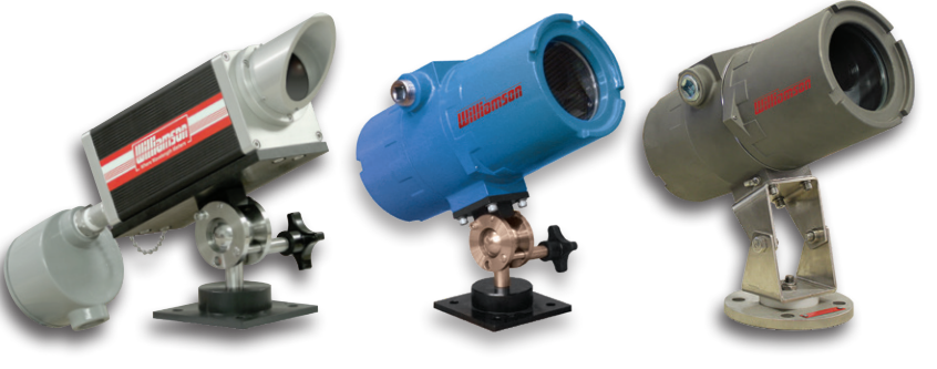
Model FM-17-N4 NEMA4X / IP65 Housing

Smokeless flares incinerate flammable hazardous vent gas with the assistance of supplemental high-velocity air or steam to prevent the formation of soot or smoke. Excessive injection of air or steam reduces combustion efficiency resulting in the release of hazardous VOC gasses while inadequate injection of air or steam results in the formation of undesirable soot and smoke. Although modern flares are designed for high flow rates associated with an emergency condition, they most commonly operate at high-turn-down, low-flow rates, making it challenging for the flare to operate at optimal combustion efficiency.